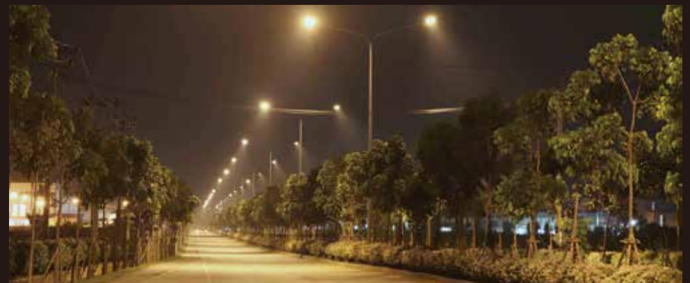
Asia Industrial Estate, a suburb of Bangkok, Thailand