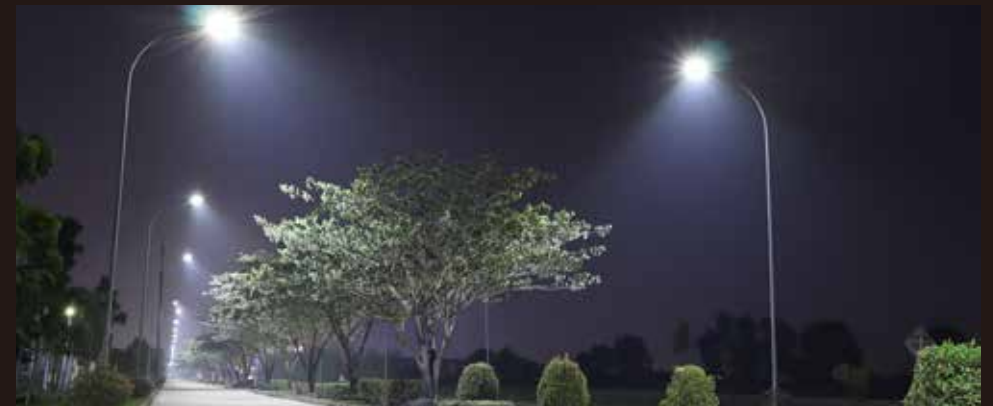
Karawang International Industrial City (KIIC), Indonesia