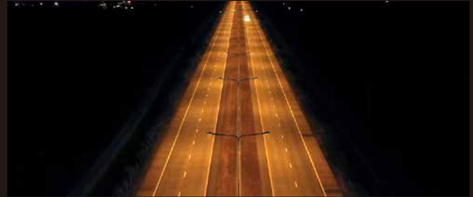
Bangkok Expressway and Metro Public Company Limited, Thailand